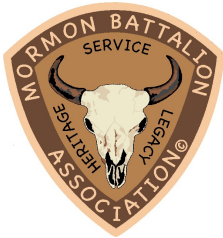
Triangular Bolo Tie Medallion

Negatives: Minimum orders are 100 each, at a cost of $752.00. Ours is a niche market product, so we don't know well the bolo ties will sell. We do not want to overextend ourselves. We may want to survey our members to see how many they will want, and do market research to tell the interest level among non-Battalion members.