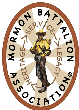
Oval Left Shoulder Patch