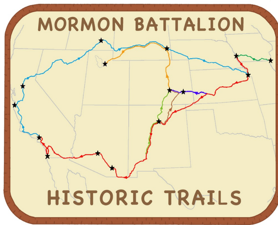
Rectangular Right Shoulder Patch