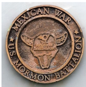
30 May 2015

[Bronze Medallion: MEXICAN WAR U.S. MORMON BATTALION around Mormon Battalion Association Logo]