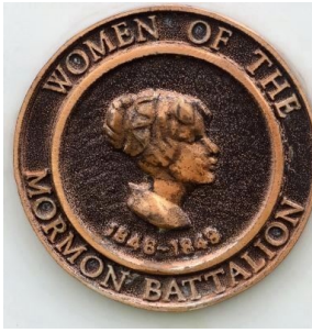
30 May 2015

[Bronze Medallion: WOMEN OF THE MORMON BATTALION around Mormon Battalion Association Woman's Auxiliary Logo]