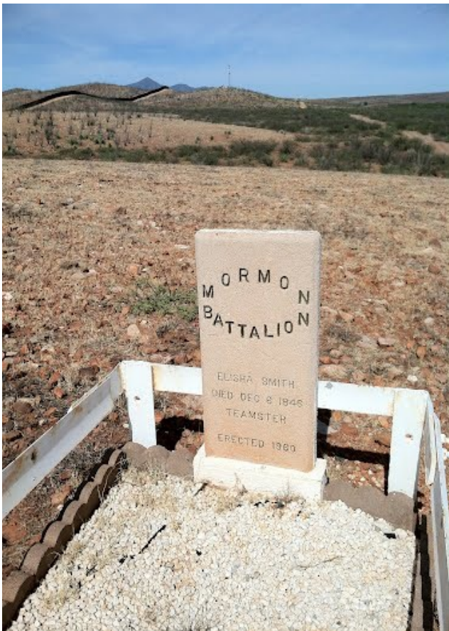
Google Earth™ photo by "Mormon Battalion," unknown date