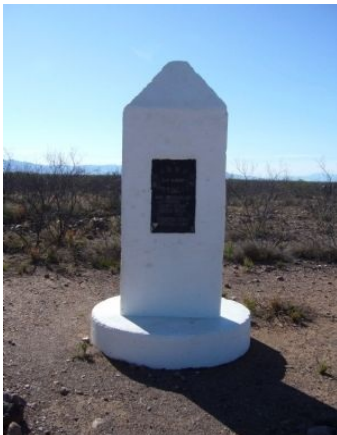
by Bill Kirchner, 3 March 2010

Triangular white concrete marker with embedded slate plaque. The date in the inscription is incomplete. The 5 December 1846 date of encampment is incorrect. They actually rested and recuperated here from 2 through 3 December 1846. More recent research shows that the Mormon Battalion trail actually ran about ½ mile south of the United States-Mexico border in this area, and that they actually camped about 1.9 miles ESE of here, near the ruins of the ranch house of the San Bernardino Rancho, abandoned about 15 years earlier. That ranch straddled the current border, but the later Texas John Slaughter Ranch only included the part north of the border.